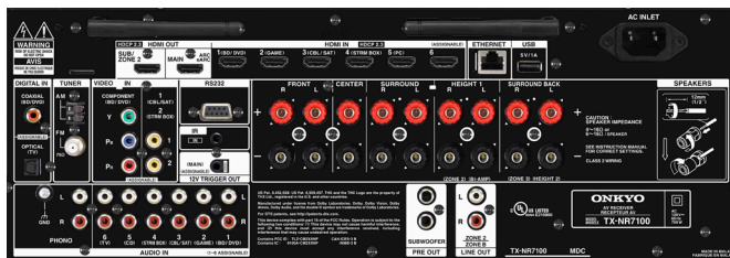
Text on receiver may vary with region.